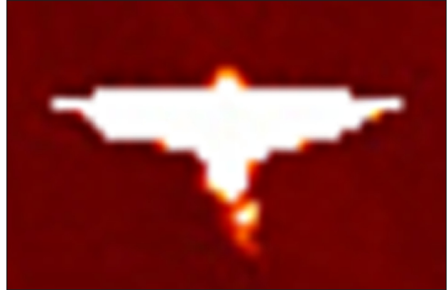
'Angel' filmed by NASA on 20 February 2013 at 7.48 am from the Solar and Heliospheric Observatory.